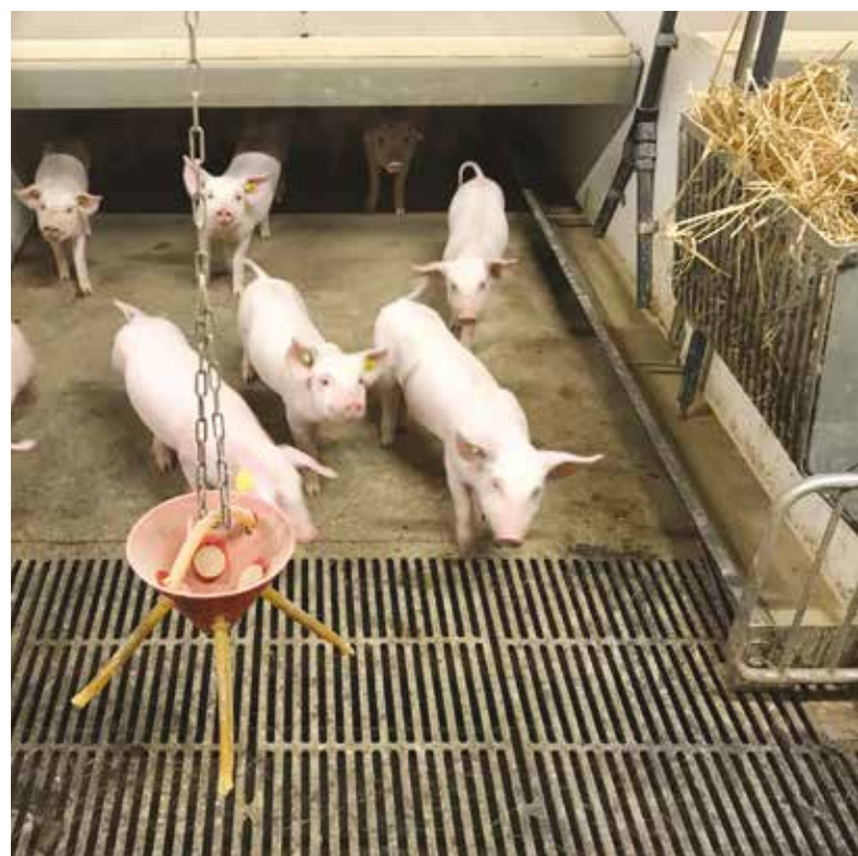
Farming on 2/3 closed surface with long trough