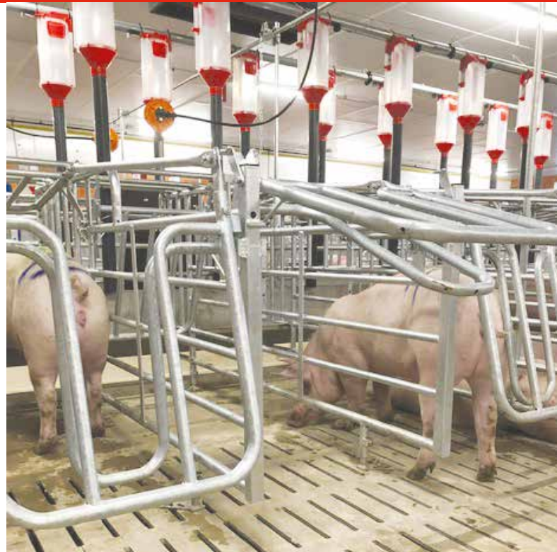
Self-catching pen type "Rocker"