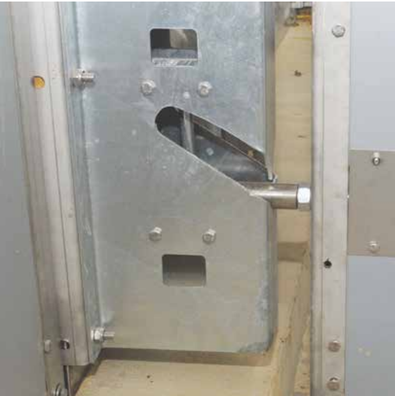
The integrated mechanism lifts the gate out of the straw.