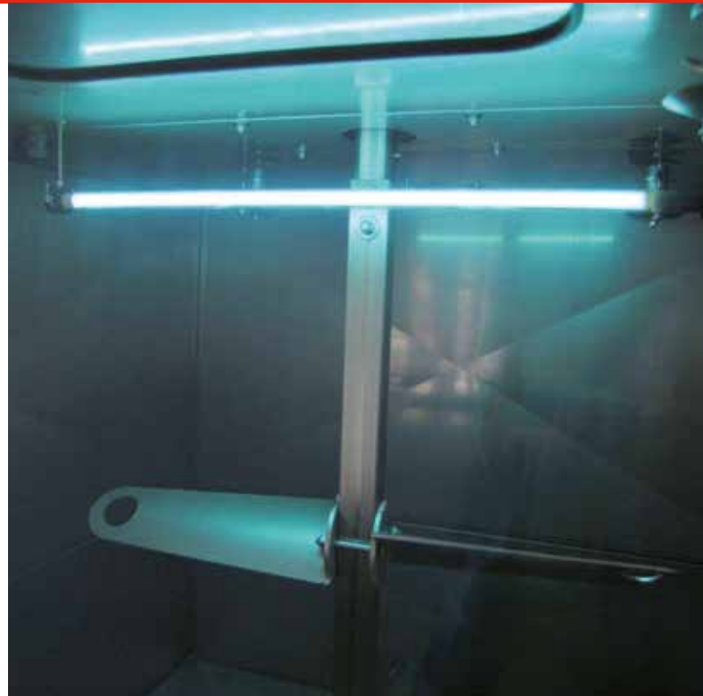
Hy.Light: tank cleaning system based on UV light for which no additives are required