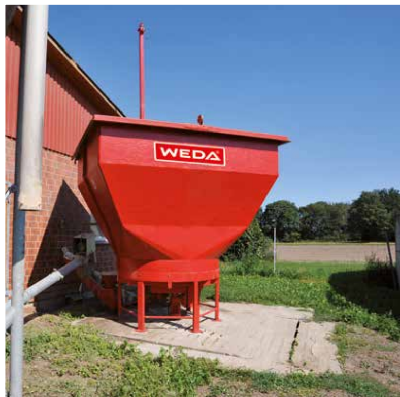
Silage fodder station for CCM, corn silage, bread and moist cereals