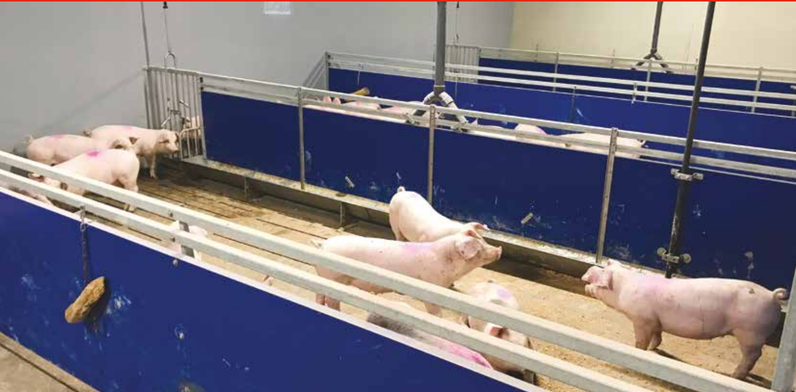
Farming of undocked animals on a solid surface with liquid feeding on long trough including feeding time measurement