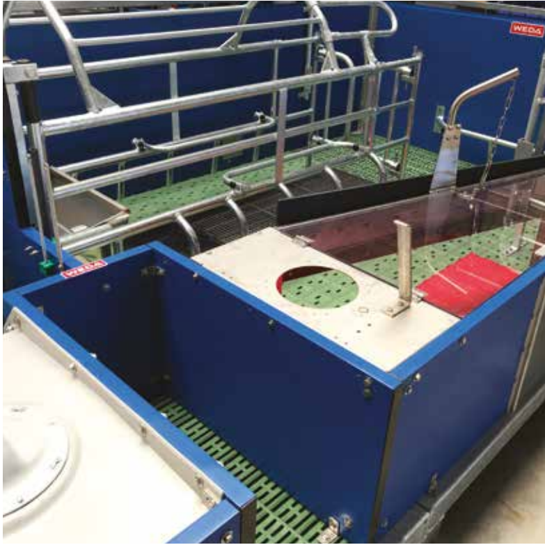
FiT movement pen