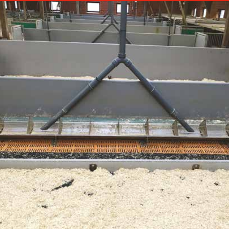
Trough in the organic house