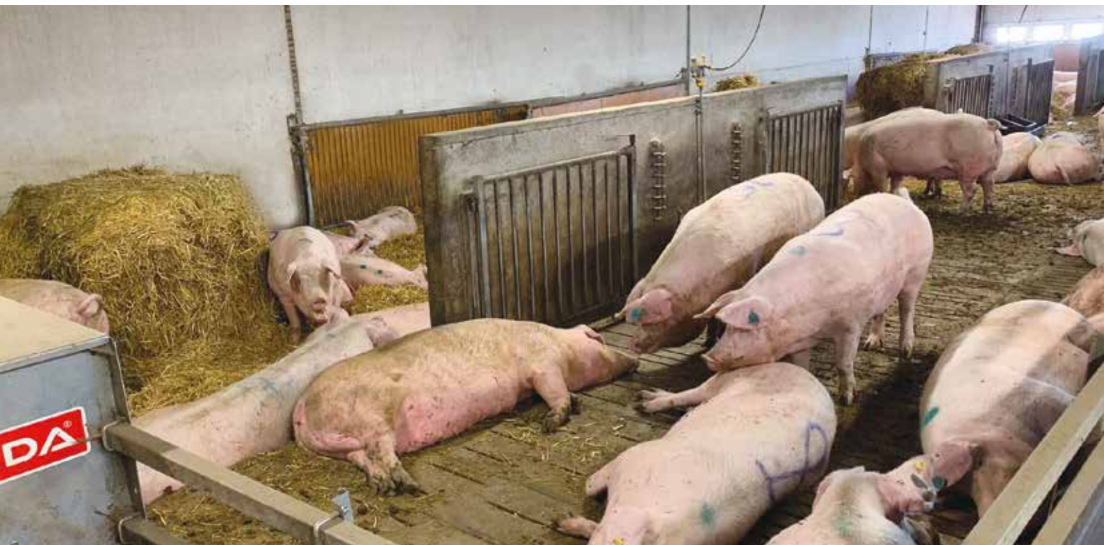
Group pens with feeding station and lockable deep bedding area