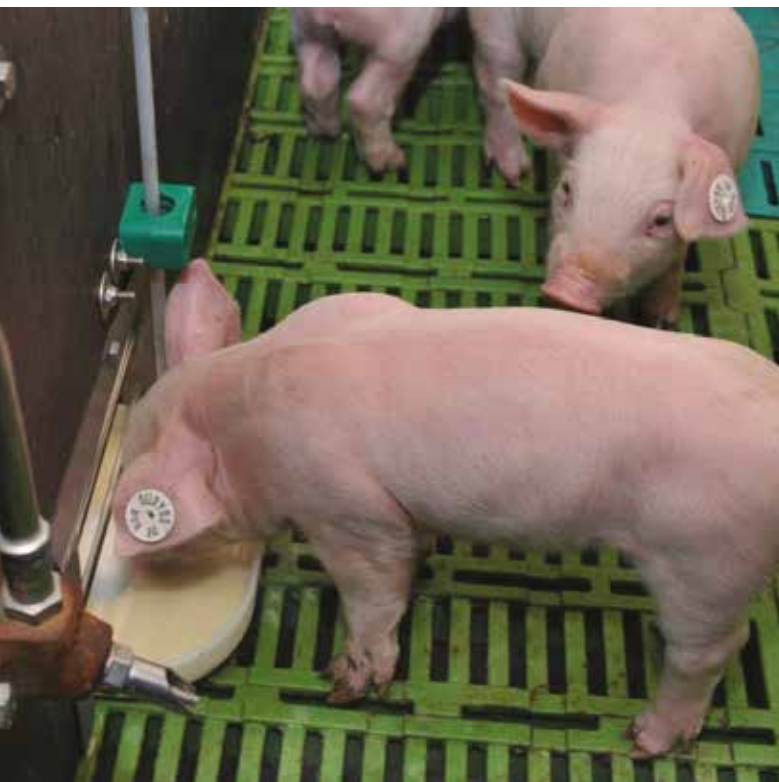
Nutrix piglet feeding system for healthy, active piglets