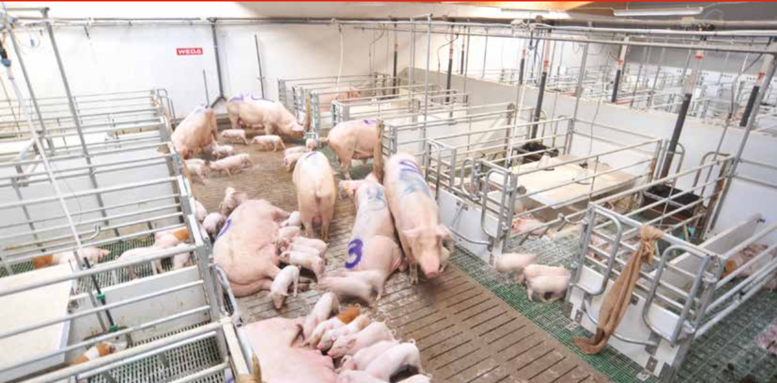
Farrowing welfare concept with Nutrix piglet feeding system