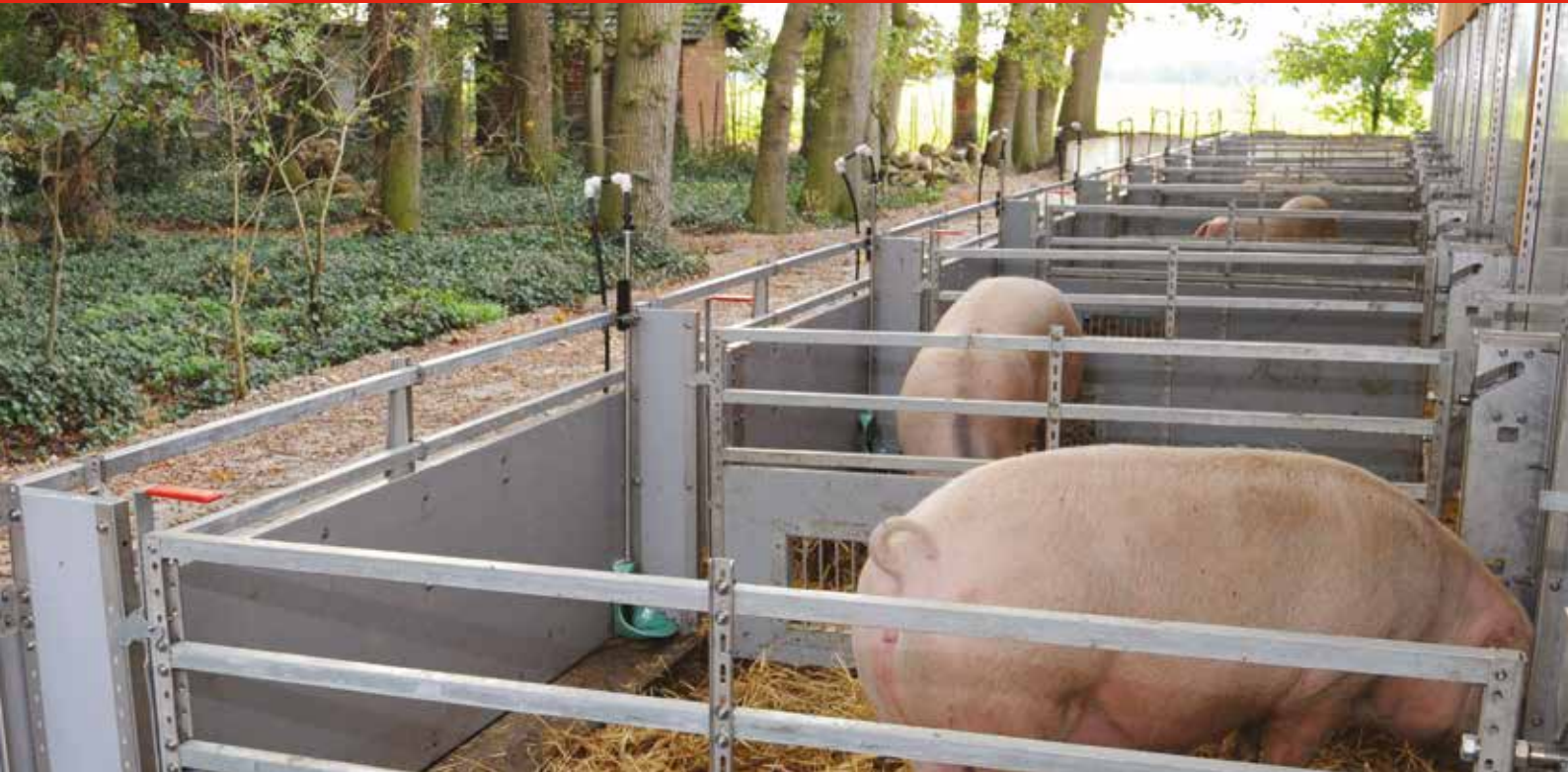
House with roaming space