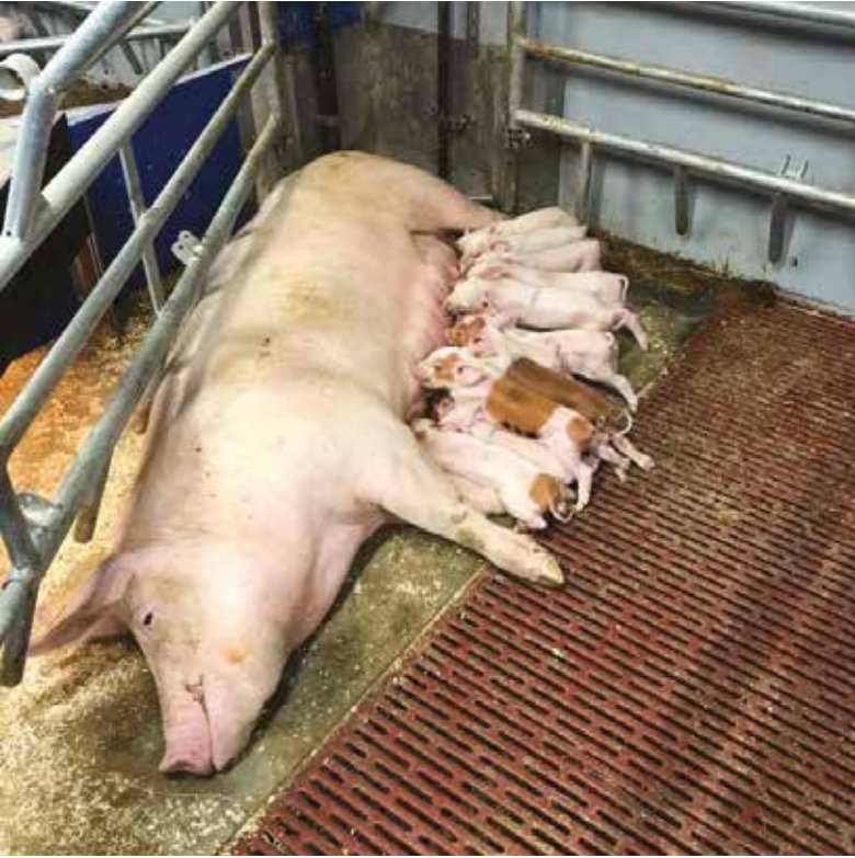
“Norwegen” movement pen with solid surface